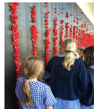
Students viewing the wall of honour.

Overall the trip was a huge success with both the students and teachers.