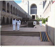
THIS IS A PICTURE FROM THE WAR MEMORIAL WHERE WE SAW A WALL COVERED IN POPPYS TO REMEMBER THE SOLILDERS