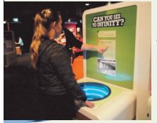
THIS IS ME AT QUESTA-CON